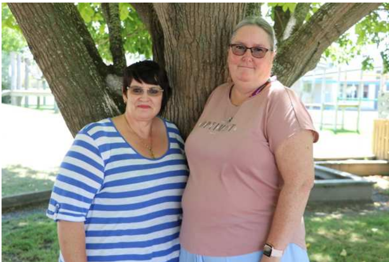
Learning Assistants -